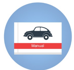
The owner's manual