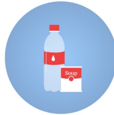
Water and nonperishable food items