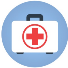
A first-aid kit