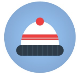
A set of warm clothes