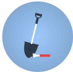
A windshield scraper and shovel