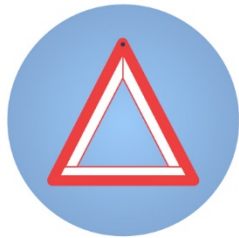
Road flares and distress signs