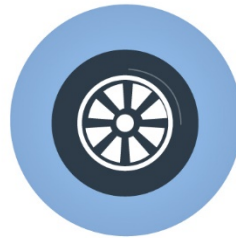
A spare tire