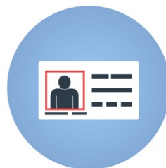
Proof of insurance